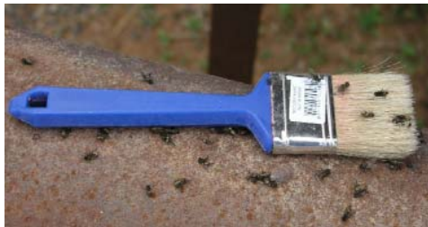
Even this paintbrush which had been left in the bucket of bait granules was effective in attracting and killing flies.

The unique potency of the attractant blend coupled with fast knockdown activity of imidacloprid makes this a deadly combination for flies.