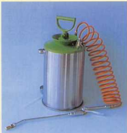
NUPET 8 Litre

Rega stainless steel pneumatic sprayers are manufactured to the strictest standards of quality control. Since we only use the best locally produced materials and components you can be sure they're Aussie tough.