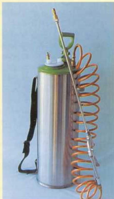
NUSS 9 Litre

A full range of spare parts is always available to ensure you're never out of action.