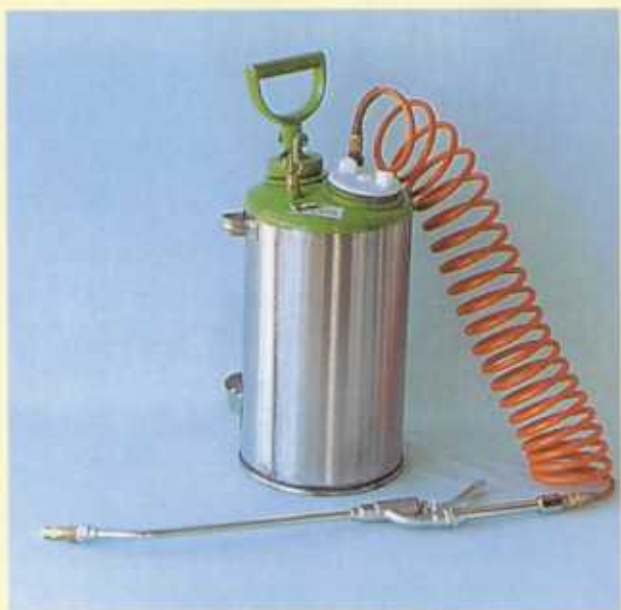
STUMPY 5 Litre

Produce top spray requirements at either high or low pressure spraying and feature pressure relief valves for added safety.